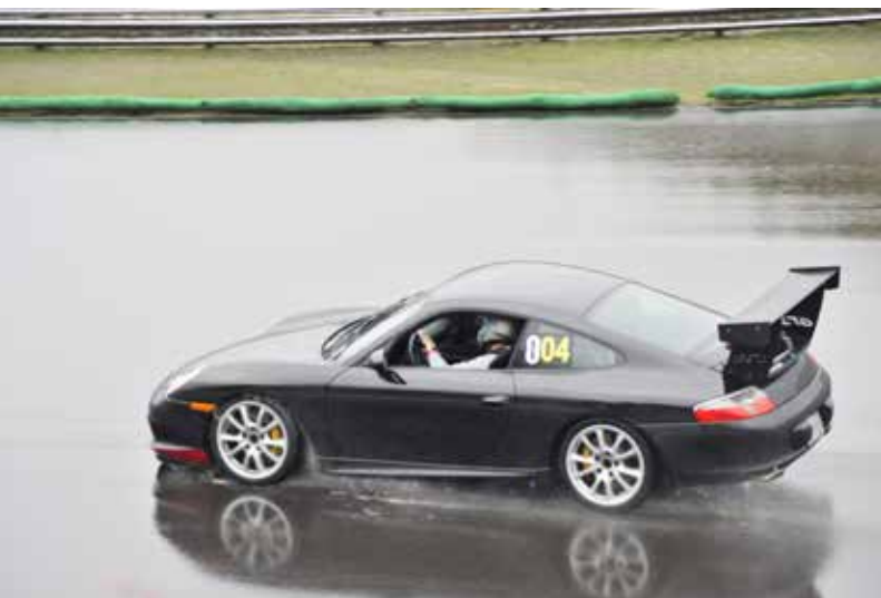
Heading to Pit In