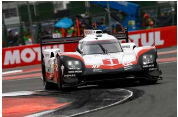
Porsche has a one-two finish at FIA WEC six hour race in Mexico City September 3 rd