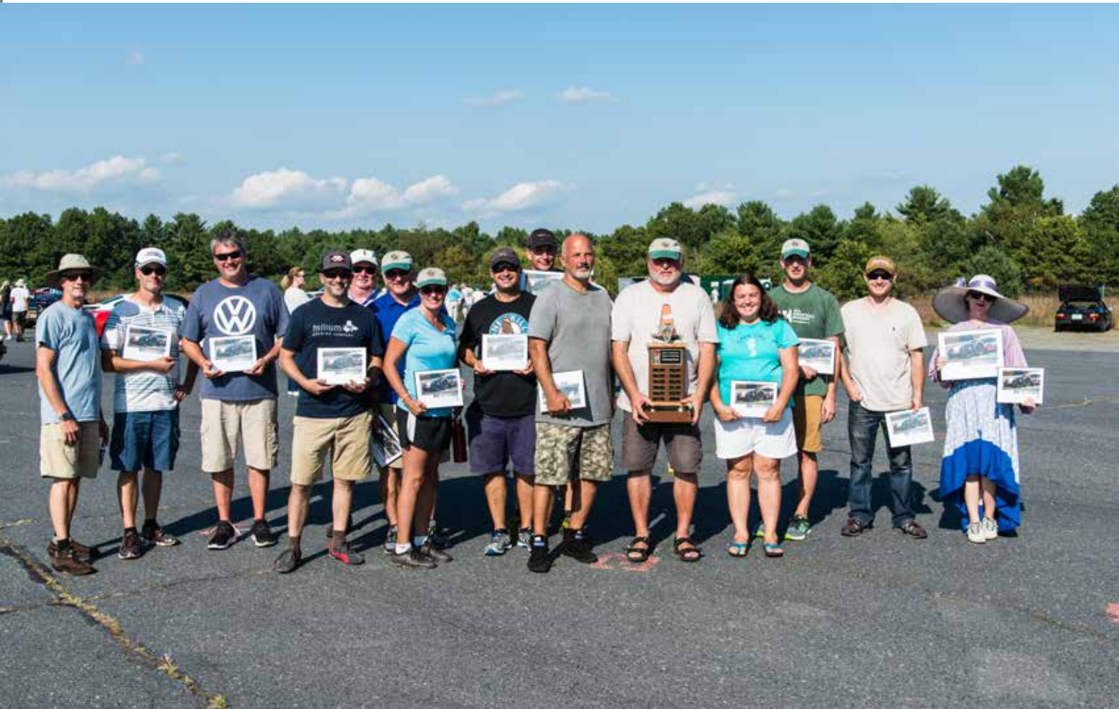
Below: North Country Region ... champions again.