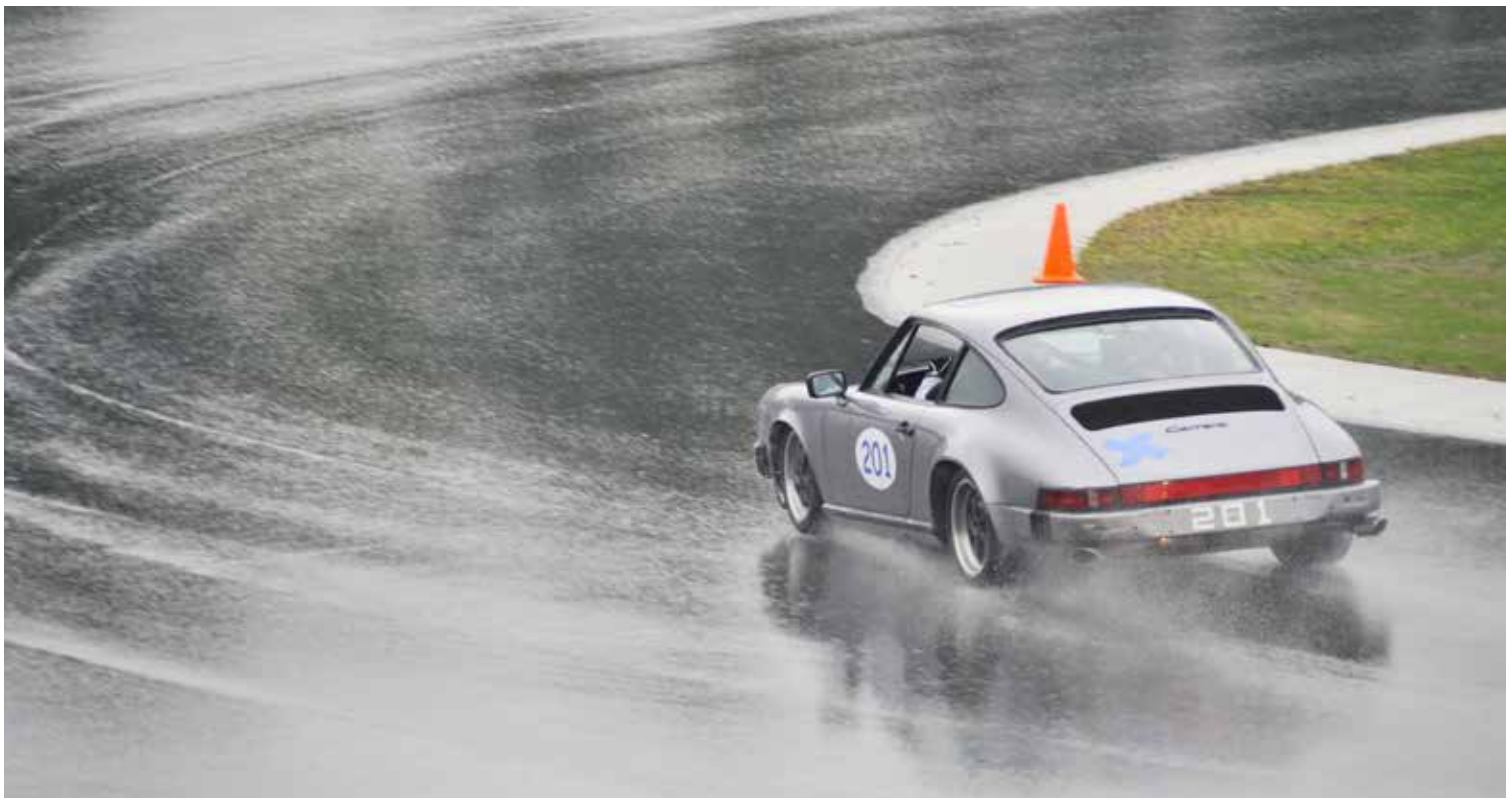
NCR's Webmaster Dick Demaine at Turn 11. The blue X does not indicate "rookie" ... it means he took the instructor's course and now knows the line at Club Motorsports course.