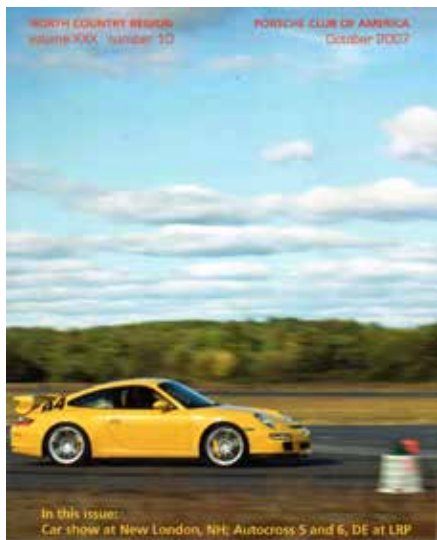
Cover: Autocross #6 September 16, 2007 By David Churcher