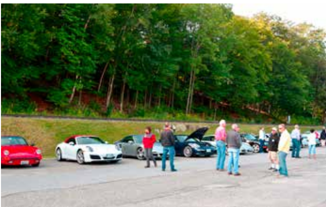
Taking a break in the driving.