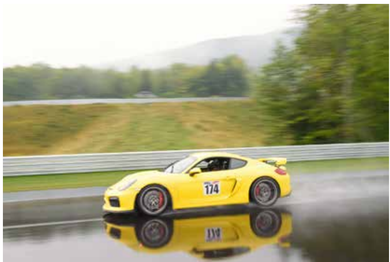
Reflections on a wet day