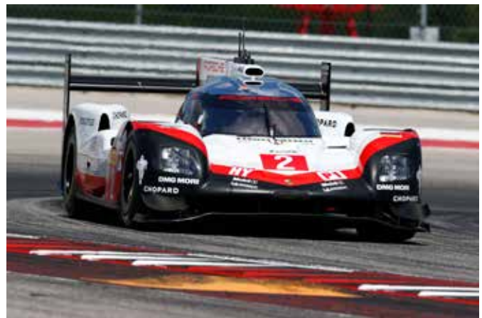
Porsche has a one-two finish at FIA WEC six hour race in Austin Texas (COTA) September 16 rd