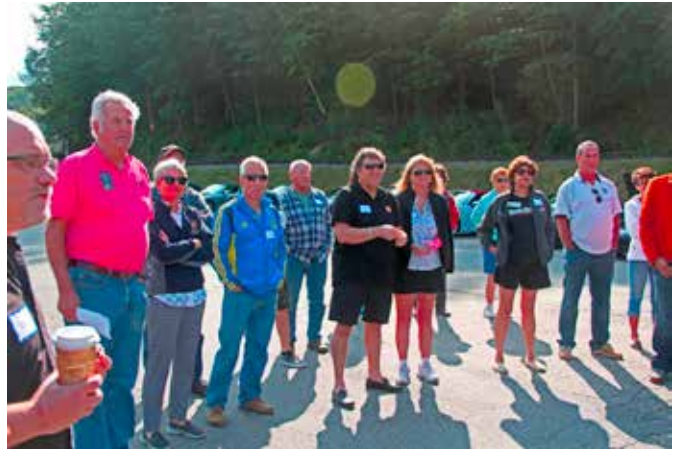
Assembled for the drivers' meeting.