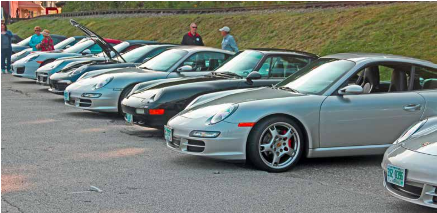
Porsches assembled at Loon Mountain Ski Resort