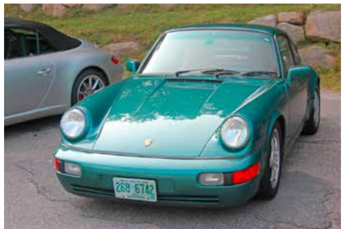
Lined up, ready to go at Loon Mountain.