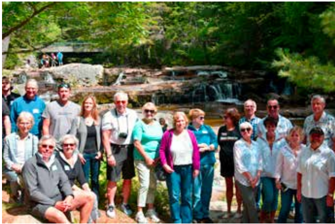
Driving group #2 at Jackson Falls.