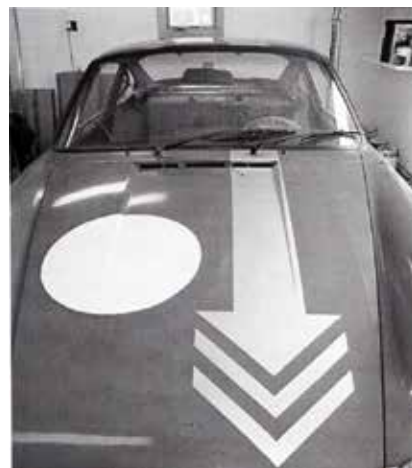
The 1970 (?) Corsica winning 908 provided much inspiration for the big silver arrow on the hood.