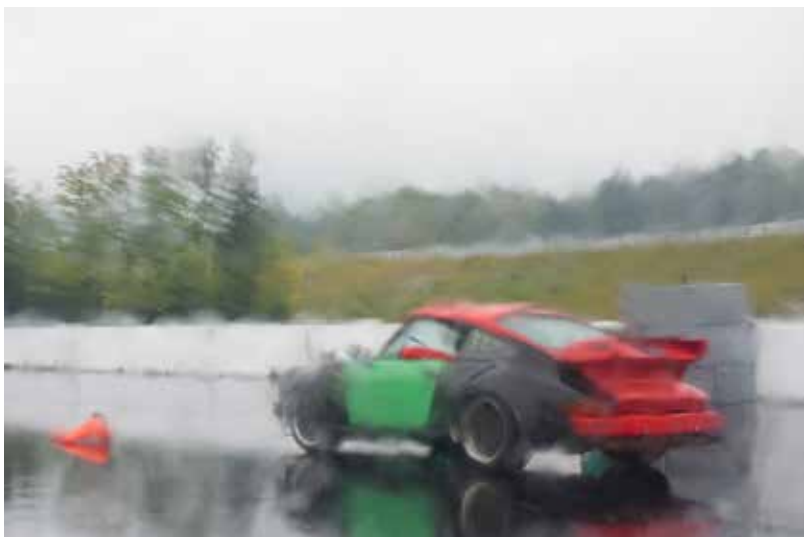
Impressionist art? No. My wet 911 windshield