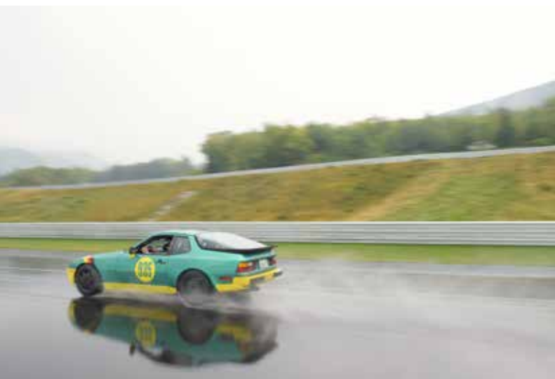
Rooster tail on the straight