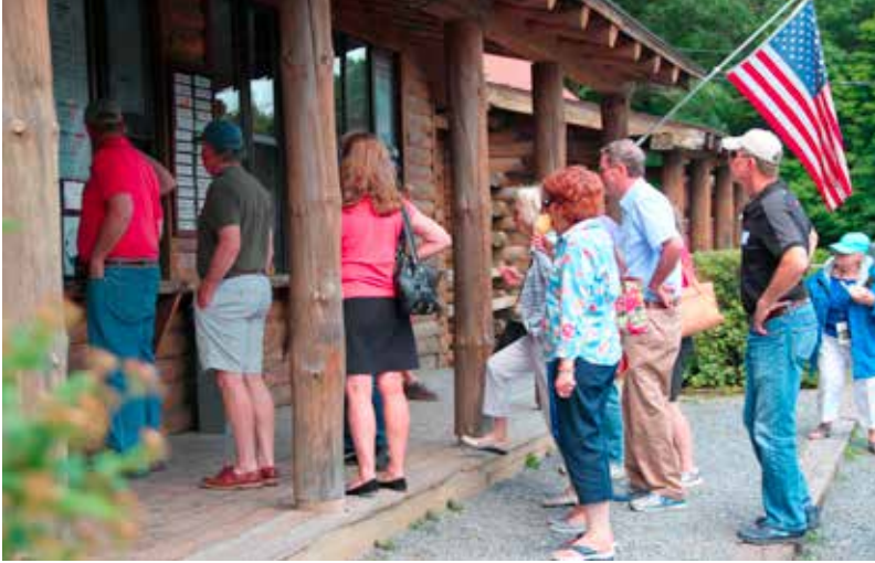
Inspirational rally photographs on this page by Harv Ames.