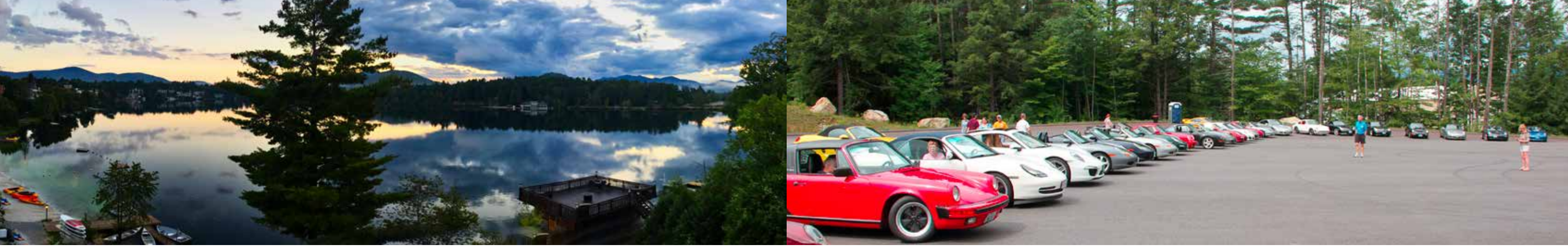
Mirror Lake at sunrise Lake Placid, NY, during NCR Get-A-Way Weekend 2018