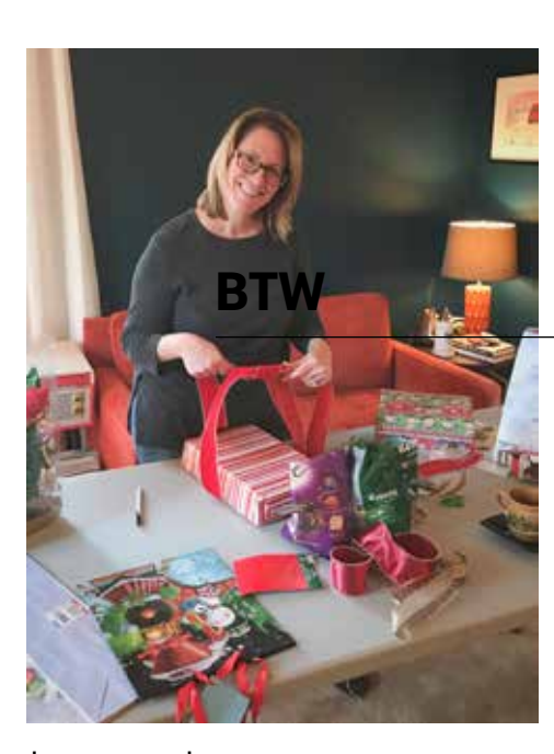
December 2018 ... Christmas shopping and wrapping by NCR Charity personnel.