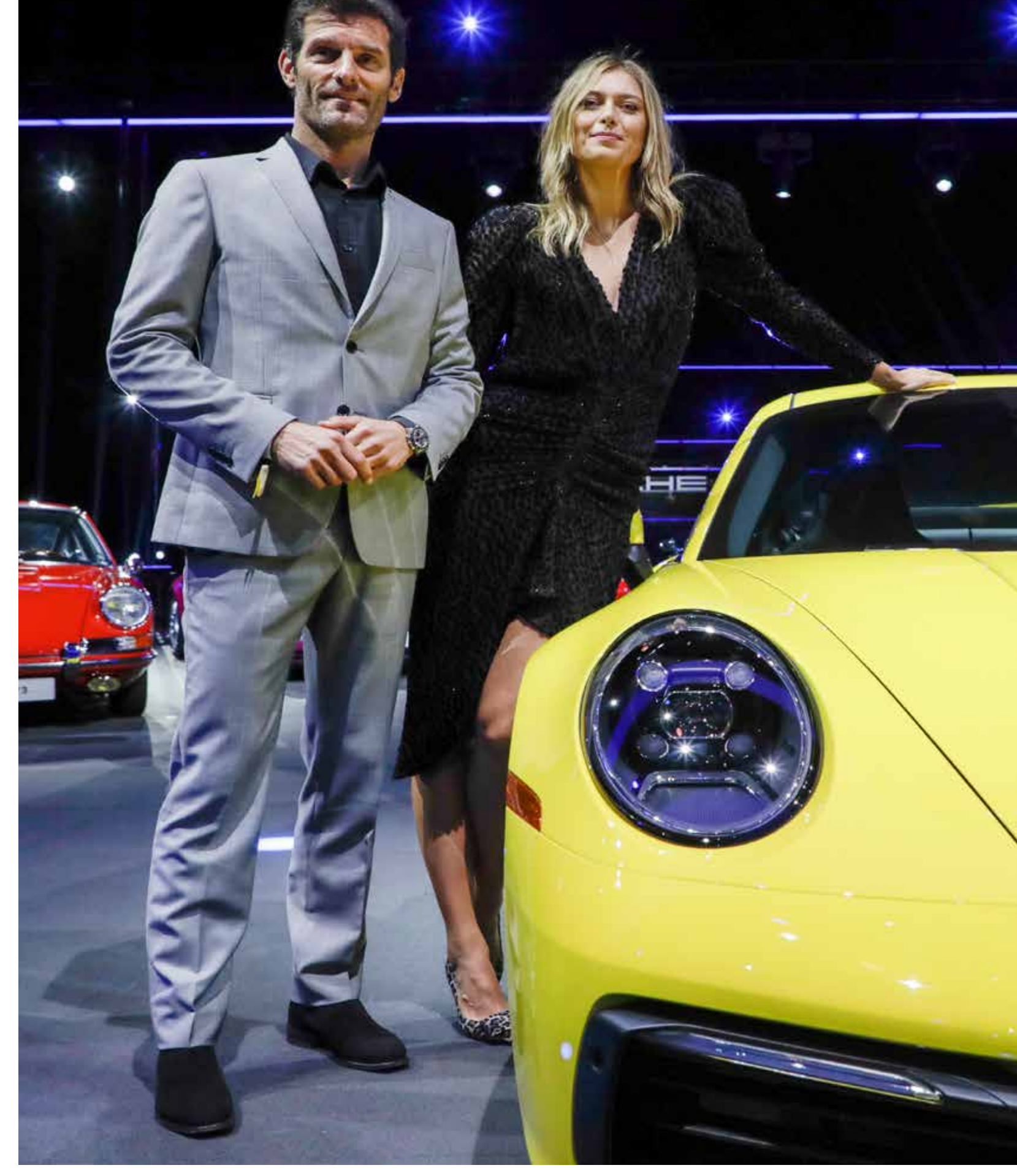
Mark Weber and Maria Sharapova introduce the 992 at the World Premier at the Los Angeles Auto Show in November 2018

From 2011, the 991 embodies the highest development stage of the Porsche 911 to date. It is an extraordinary reflection of this sports car manufacturer's leitmotif: striving for the best possible efficiency. This can be seen in all aspects, starting with its evolved design. A more compact silhouette, tension charged surfaces, and precisely defined details mean the 991 looks more powerful than any other previous 911 – an effect heightened by the wider track and the wheelbase that was extended by ten centimeters. It also features adaptive aerodynamics: the 911 is the first series sports car from Porsche to adopt these from the 918 Spyder hybrid supercar. The 991 generation of the 911 is the absolute best seller in the history of this icon. 217,930 of them were built by October 31, 2018. In total, Porsche has produced 1,049,330 series 911s since its debut in 1963.