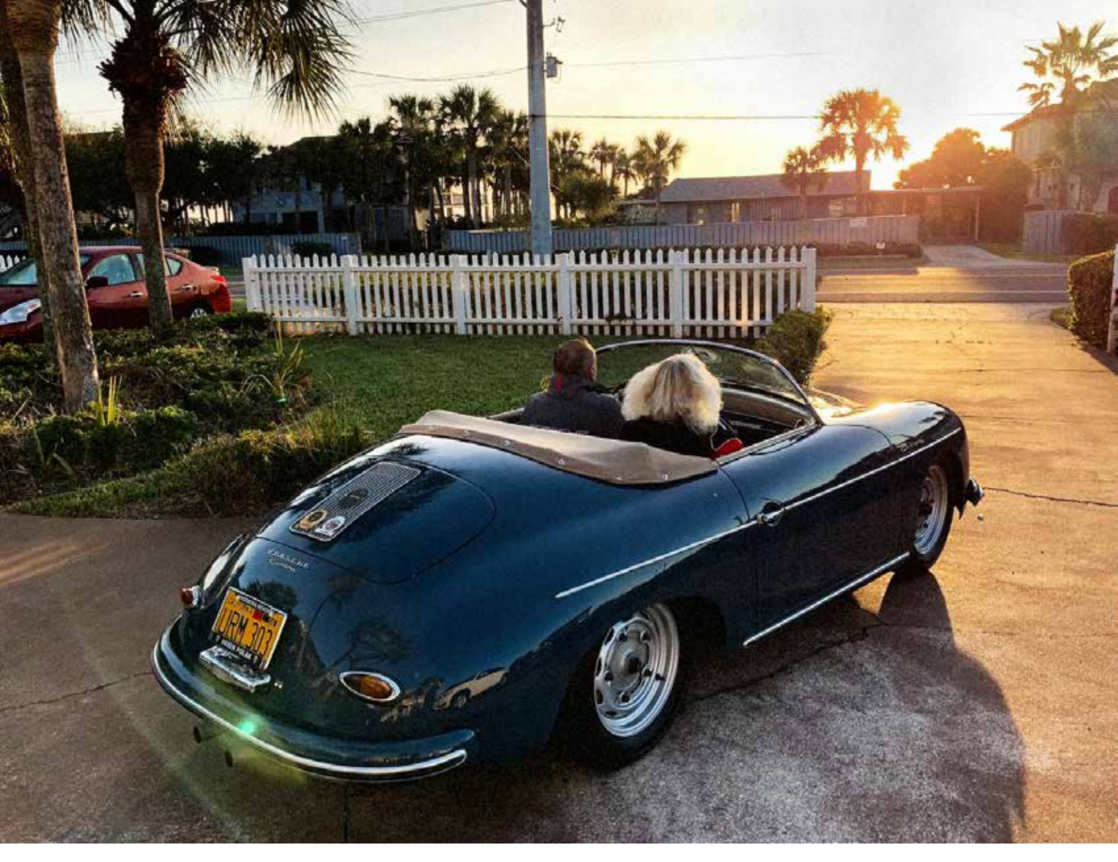
Ivy and Jerry Charlup off to the Eight Flags Tour at sunrise in Jerry's '57 Carrera Speedster. Photo taken from the man-deck as they were leaving the house [Chez Cheese] .

Amelia Island: the northernmost of the Florida chain of barrier Islands, Amelia is known for its wonderful low country feeling of roads canopied by Spanish moss-draped live oaks, beautiful beaches, great restaurants, and of course the annual gathering of car enthusiasts at the Amelia Island Concours d'Elegance.