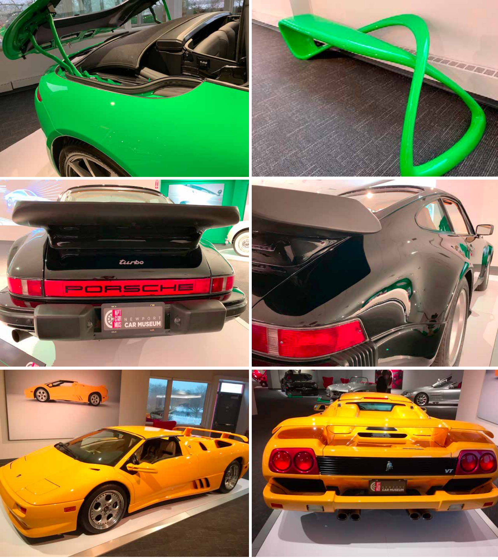
Top four photographs by Kristin — a Viper G reen 911 with a matching modern piece of furniture. Lower two photographs by Stephen — a 1989 Lambo Countach.