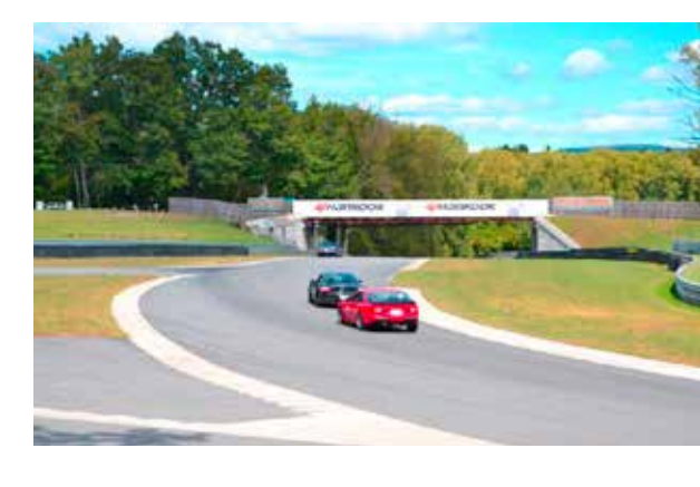
Thursday August 1<sup>st</sup> New Hampshire Motor Speedway

Monday and Tuesday July 22<sup>nd</sup> & 23<sup>rd</sup> Lime Rock Park