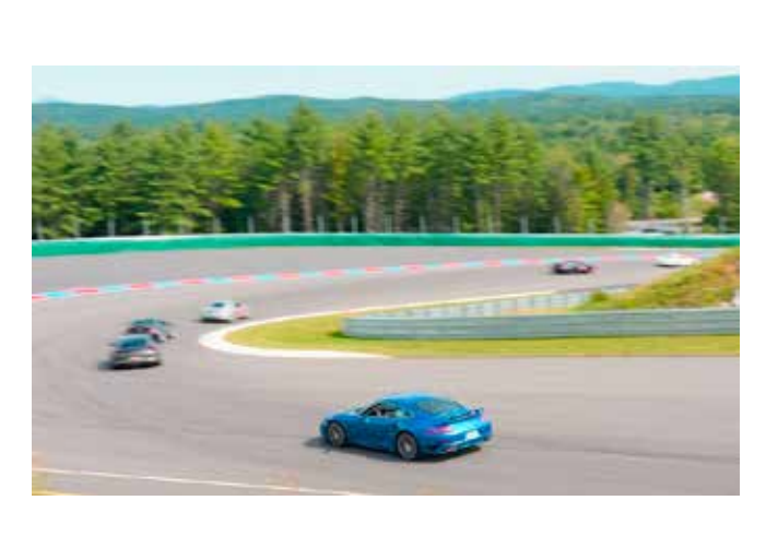
Saturday and Sunday October 19<sup>th</sup> & 20<sup>th</sup> Club Motorsports

Registration is open <a href="https://ncr-pca.motorsportreg.com/">https://ncr-pca.motorsportreg.com/</a>