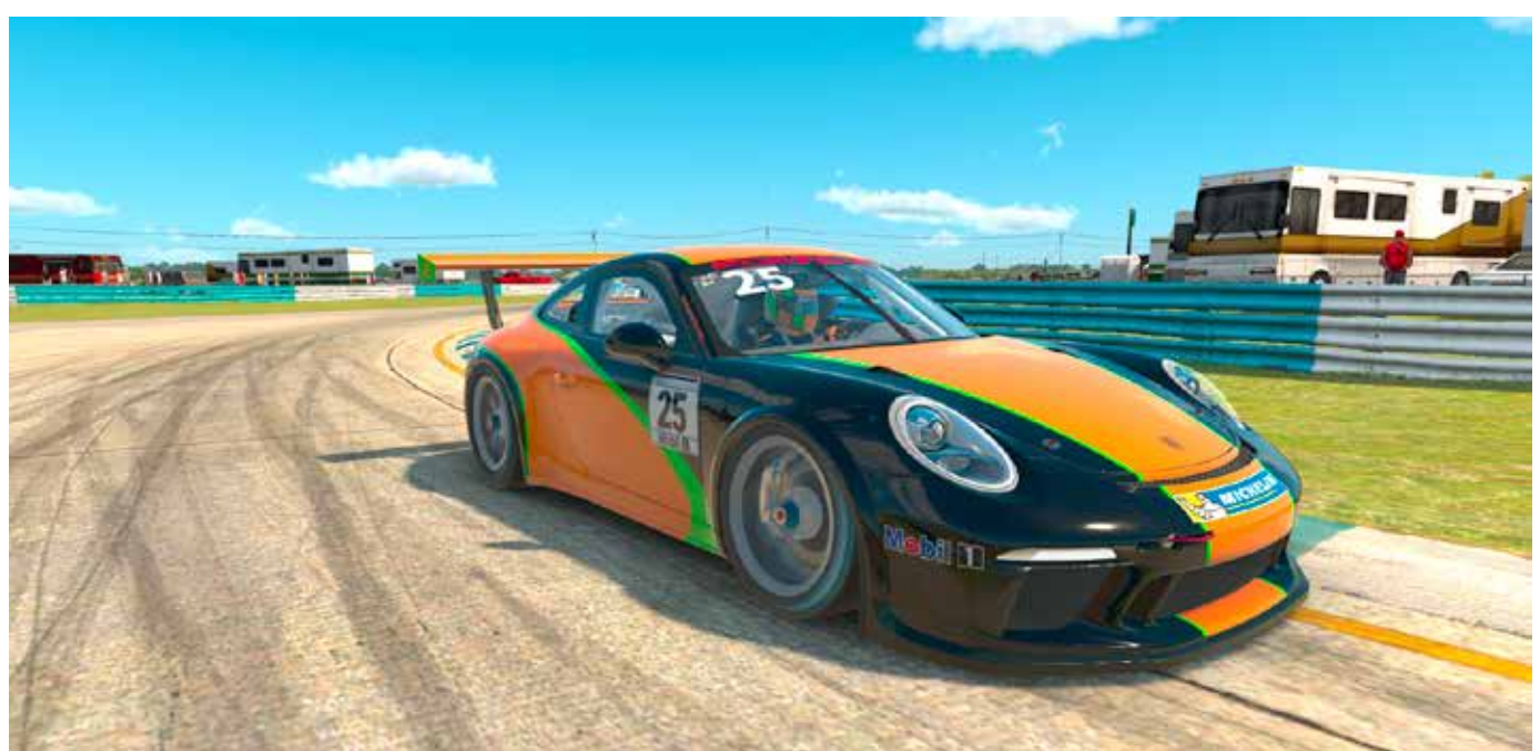
The above graphic is a rendering of Jeremy's number 25 Porsche. The renders are extremely realistic for the driver and for the audience who watch a race on YouTube.